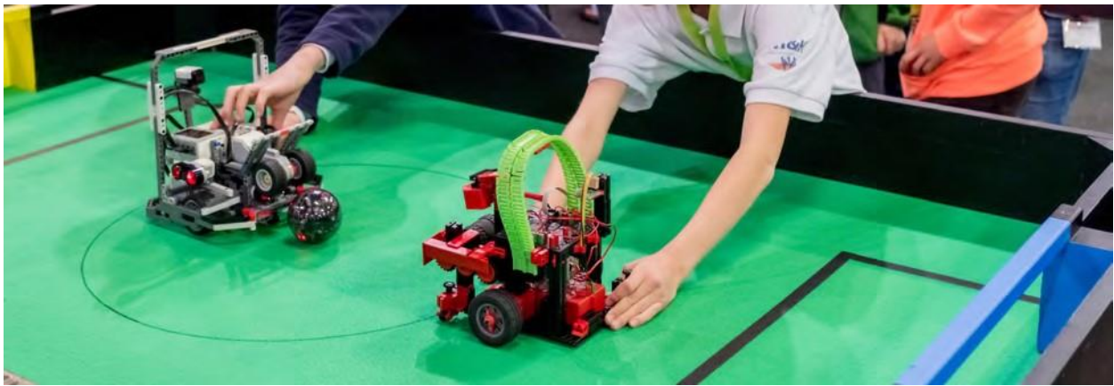
Figure 1 Two teams with one standard kit robot each will compete using an IR ball on RCJ Soccer fields without the out-area. There is no need for using camera vision or line detection.

The aim of this document is to provide an entry-level rule set for RCJ Soccer that is harmonized across countries in Europe and that may be referenced at European local and super-regional tournaments, as well as beyond Europe if needed. However, some sub-regions may have their own version of Soccer Entry rules. Teams are advised to check with their Local Organizing Committee and Regional Representative regarding updates and changes to this rule set specific to their location. Each team is responsible for verifying the correct and latest version of the rules prior to competition.