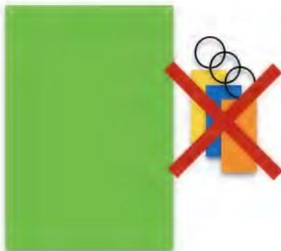
Figure 2 Anyone close to the playingfield is not allowed to wear orange, yellow or blue clothes